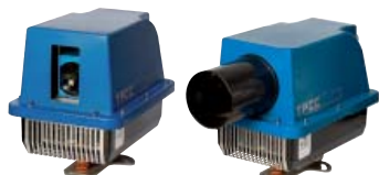
TPCC / DM Suitable for Optical Distance Meters, e. g. DME3000 / DME4000 / DME5000, DS500 / DT500

TPCC Thermo Protection Cooling Case Thermal protection up to 176°F (+80°C)