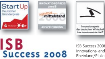
ISB Success 2008, awarded by Innovations- und Strukturbank Rheinland/Pfalz (ISB), Germany